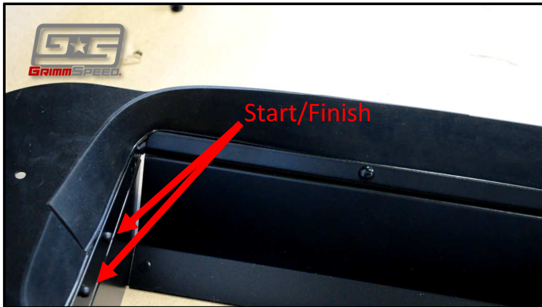
Figure 2: Start and finish points on the splitter gasket