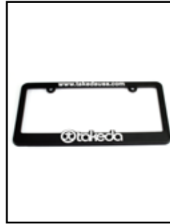
Lic. Plate Frame