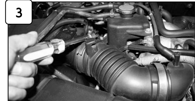
3 Disconnect MAF sensor. Loosen clamps on intake tube using 5/16" nut driver.