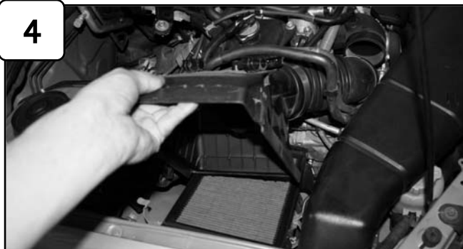
4 Pull back vacuum lines on top of air box. Remove upper half of air box with intake tube.