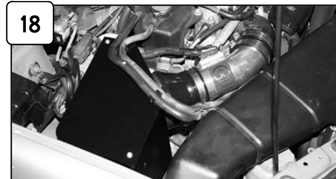
18 The installation of your Takeda performance intake is now complete. Please check all components and re-tighten if necessary. Thank you for choosing Takeda!