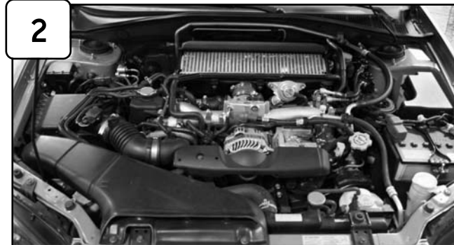
2 Complete Stock intake. Please disconnect battery terminals before installation.