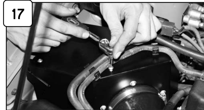
17 Install cover and tighten using 4mm allen key. Attach vacuum lines to cover tabs.