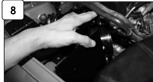
8 Install housing into vehicle and position tab to frame and bolt from step 7. Tighten using 12mm socket or wrench.