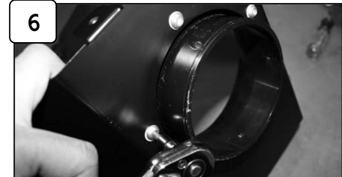
6 Install filter adaptor to housing using supplied button head screws and wavy washers. Tighten using 4mm allen key.