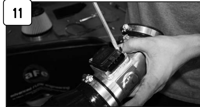
11 Install MAF sensor on intake tube using M4 screws provided. Attach couplers with clamps to intake tube.