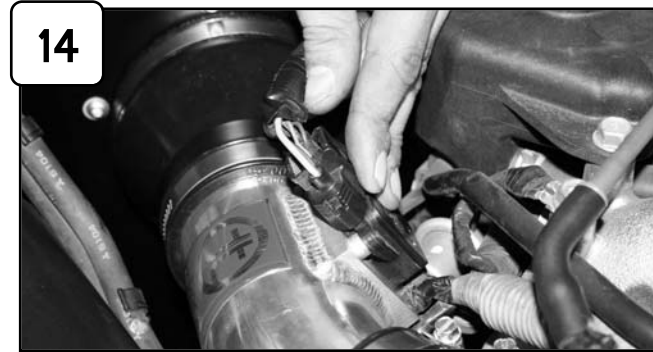
14 Re-connect MAF sensor harness.