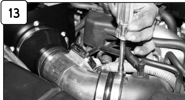
13 Tighten all clamps using 5/16" nut driver.