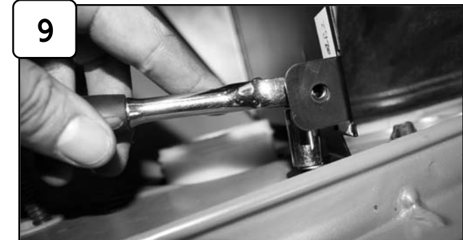
9 With screw and washer provided, tighten top of housing tab to inside of fender using 10mm socket or wrench.