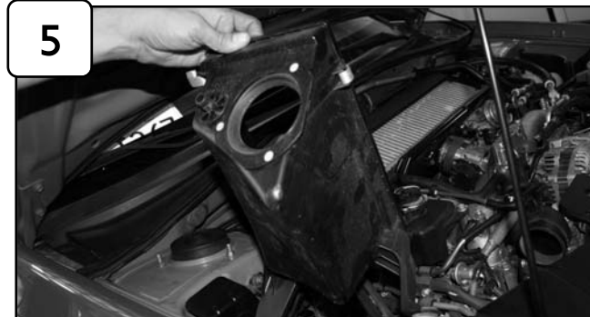
5 With 12mm socket or wrench, loosen the 2 bolts securing bottom half of air box and remove.