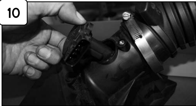
10 Remove MAF sensor from stock intake.

For replacement part(s) or "Restore Kit" please log on to takedausa.com P.O. Box 1719 Corona CA, 92878