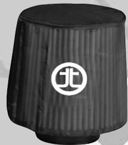
Pre Filter P/N: TP-7011B

Note: Filter Cleaning: When cleaning your Pro Dry S™ filter, be sure to use only "Restore Kit" (Takeda P/N: TP-7015C Pro Dry S™ cleaner only.)