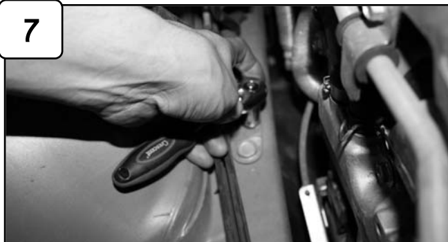
7 With 12mm socket or wrench loosen the bolt on frame and save for install of housing tab.