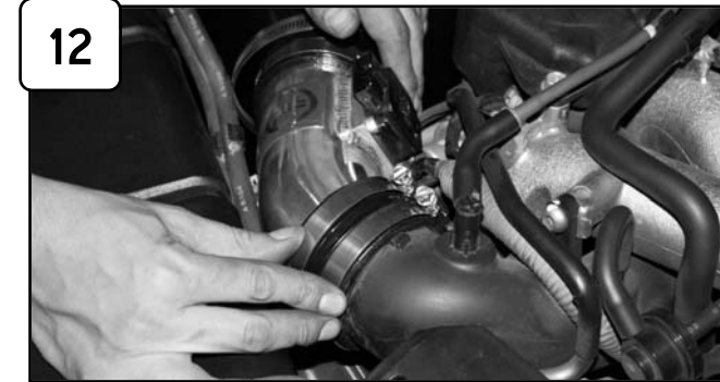
12 Install and position new tube to throttle body and filter adaptor.