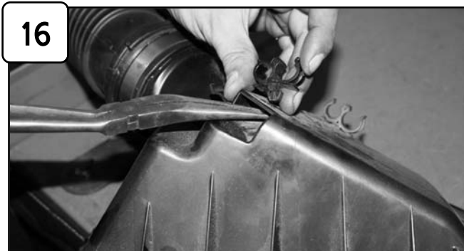
16 Remove clips from upper half of air box. Attach onto new cover.