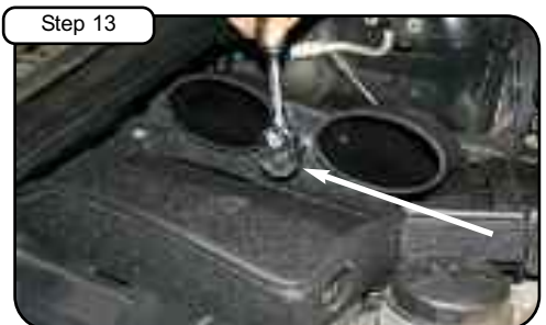
Install screw, washer and wavy washer provided, and tighten with 10mm socket or wrench. Tighten clamps to tube with 1/4" nut driver.