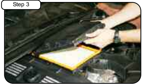
Unclip upper half of air box to remove lid and filter.