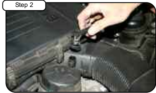
Disconnect vacuum line and pull back.