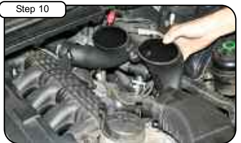
Install new tube into vehicle and pull back towards driver fender. Do not tighten clamps.