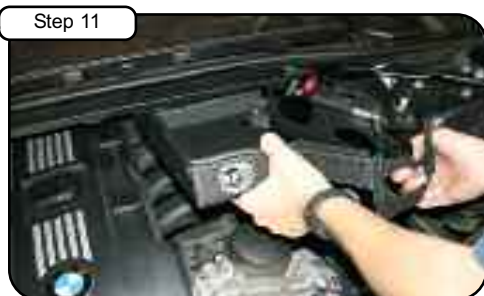
Install housing into factory position.