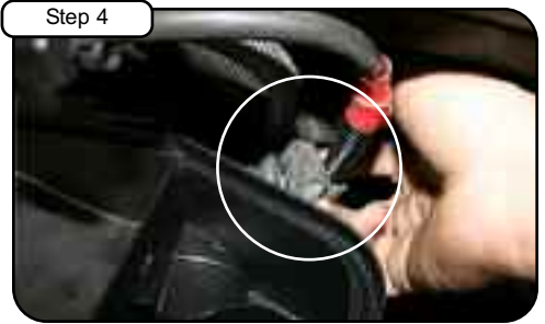
Pull back rubber mount attached to battery cable. Use pliers if necessary. This will allow stock clamp to be loosened. (To be done in step 5B.)