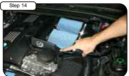
Install air filters and tighten with 5/16" nut driver and connect vacuum line.