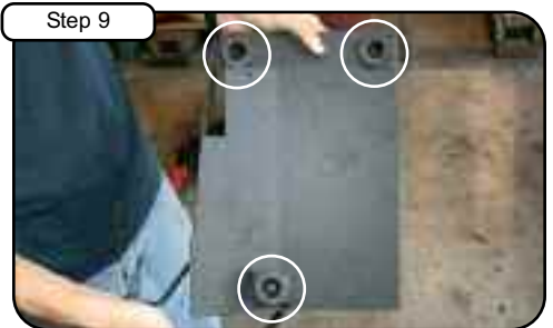
Install rubber grommets from step 7 on new housing.