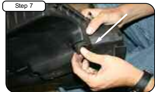
Remove the 3 rubber grommets from the air box. (To be used in step 9.)