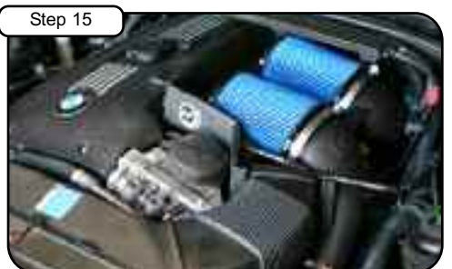
Your installation is now complete. Please check all clamps and hoses periodically and tighten. Thank you for choosing aFe!