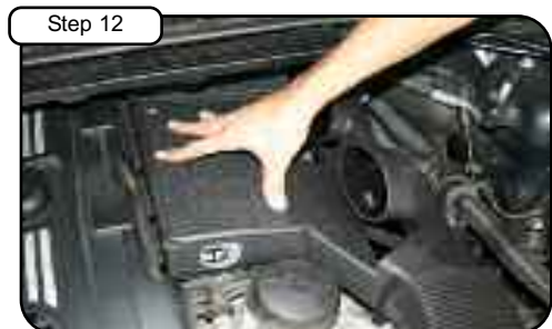
Push down housing allowing grommets to seat. Align threaded insert with hole on housing.