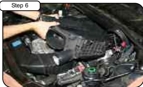
Remove complete air box from vehicle.