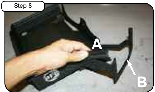
A) Attach 7/16" trim seal to top of housing. B) Attach rubber edge trim seal to ram air cut out on housing.