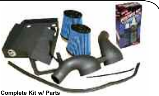
Complete Kit w/ Parts